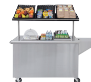
Mobile Breakfast Cart by HUBERT® - Stainless Steel with Ice Bin