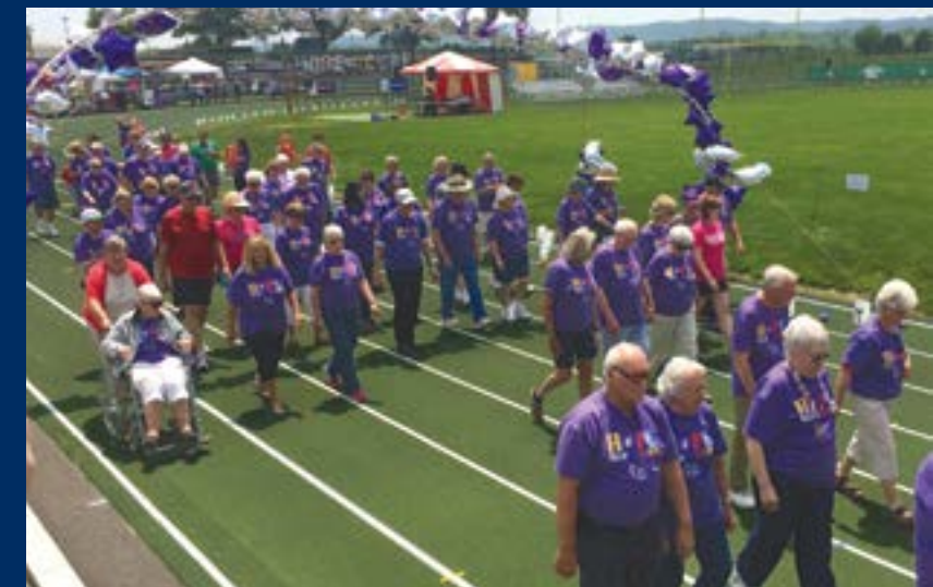
Relay for Life Event