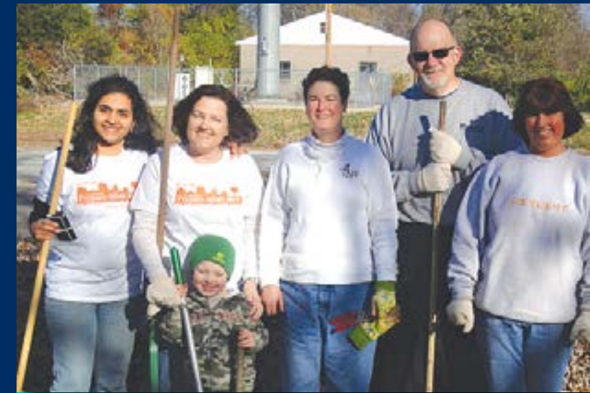
People Working Cooperatively

This fun-filled overnight event celebrates survival while raising money for cancer research and programs. Hubert employees have raised funds and participated in this event since 2002.