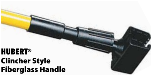
HUBERT® Clincher Style Fiberglass Handle Designed for wet mops with a 5"W headband, has nylon jaws to grip the headbands. 54"L. 68946.....17.49