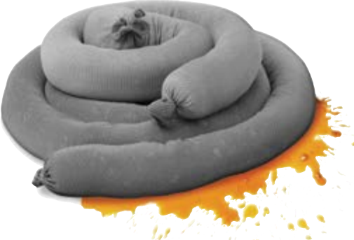
HUBERT® Absorbent Safety Sock 3"Dia flexible Safety Sock locks in up to 1.13 gallons of liquids. 48"L. Sock colors may vary per shipment. 58861.....4.29