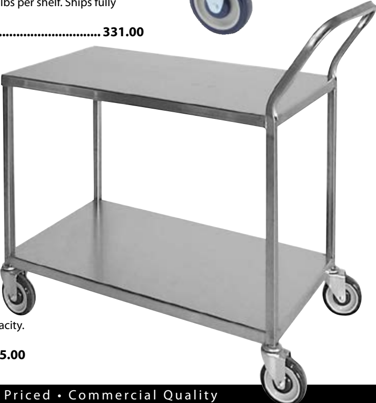
HUBERT® Stainless Stock Cart All-welded, 304 series 16 gauge stainless steel with 1" square post. Four 5"Dia swivel casters. 600 lb. capacity. 41L x 20W x 40H. 58 lbs. 92500* ..... 785.00 *Truck Ship