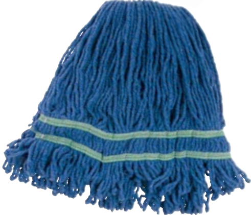
HUBERT® Premium Wet Mop Head Looped-end and made of 4-ply blend yarn for excellent absorbency. Ideal for all standard mopping needs. Launderable. Use with Gate-Style Mop Handle, sold separately. 16 oz. 1"W. 3 per pack. Blue. Additional sizes available. 71848..... 37.99