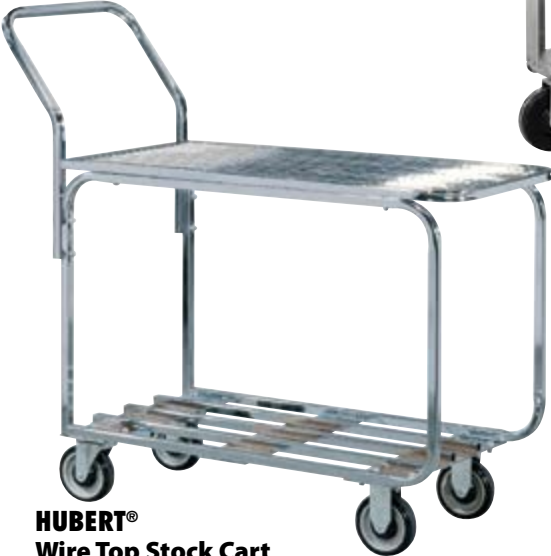
HUBERT® Wire Top Stock Cart Welded stock cart features a top deck of reinforced wire with a bottom of tubular bar construction. Four 5"Dia plate casters (2 swivel, 2 rigid). 400 lb. capacity. Some assembly required; handle is bolt-on. 36L x 18½W x 40½H. Plated steel. Stock Cart 80014* ..... 242.00 Replacement Caster Kit 50880 ..... 77.49 *Truck Ship