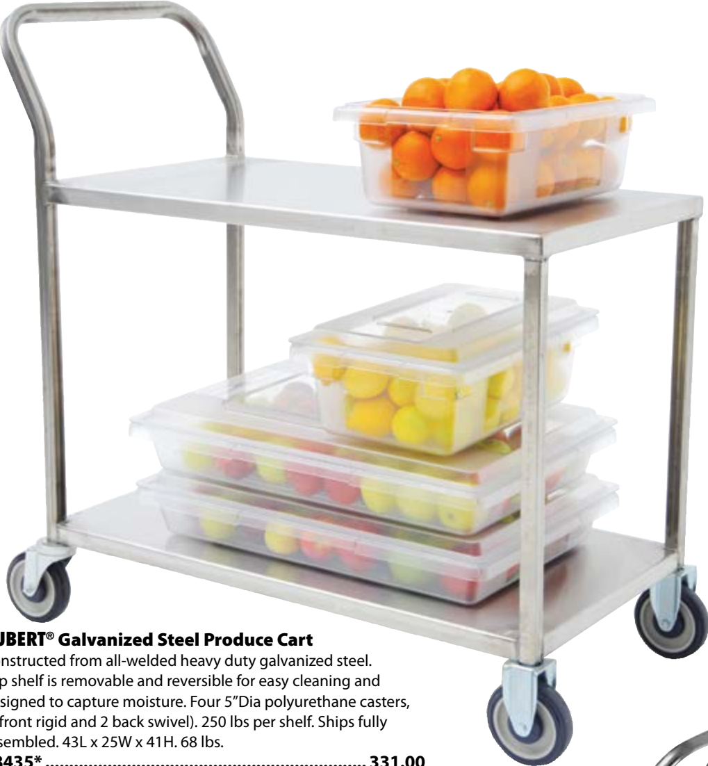
HUBERT® Galvanized Steel Produce Cart Constructed from all-welded heavy duty galvanized steel. Top shelf is removable and reversible for easy cleaning and designed to capture moisture. Four 5"Dia polyurethane casters, (2 front rigid and 2 back swivel). 250 lbs per shelf. Ships fully assembled. 43L x 25W x 41H. 68 lbs. 98435* ..... 331.00 *Truck Ship