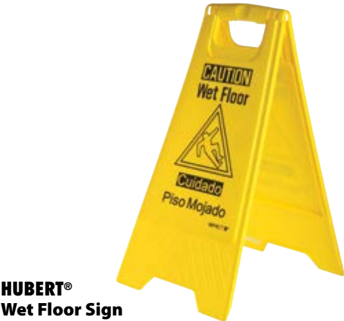
HUBERT® Wet Floor Sign Safety yellow floor sign displays bilingual warning in English and Spanish with bright graphics. 25"H. 54426.....18.99