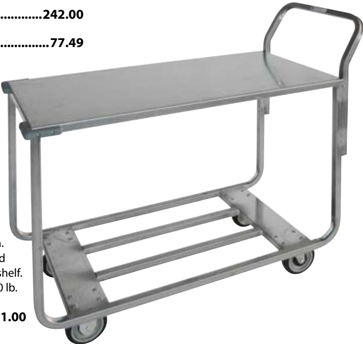
HUBERT® Galvanized Steel Utility Cart Heavy-duty galvanized construction. All-welded 1" square frame with solid upper shield and tube styled lower shelf. Four 5"Dia polyurethane casters. 750 lb. capacity. 47L x 20W x 40H. 92292* ..... 291.00 *Truck Ship

Same Day Shipping for most orders placed by 2 pm EST