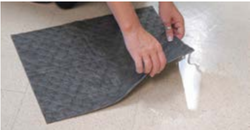
HUBERT® Absorbent Spill Pads Capture up to 30 ounces of liquid per pad. Ideal for use on both oil and water-based spills. 18L x 15W pad is perforated down the middle for use on smaller spills. Grey. 25 per box. 81504.....30.39