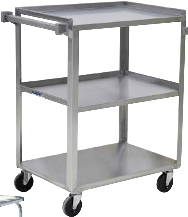
HUBERT® 3-Shelf Stainless Steel Cart Stainless steel construction with a brushed finish. Four swivel casters with non-marking rubber wheels and 2 front bumpers. 500 lb. capacity. 31L x 19W x 32H. 39 lbs. 39358** ..... 259.00 **Additional shipping cost OVERSIZED

Same Day Shipping for most orders placed by 2 pm EST