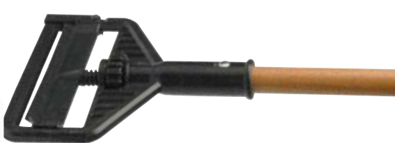
HUBERT® Gate Style Wood Handle Lever system with an adjustable locking wheel to hold mops with a 1"W headband. 60"L. 86197..... 13.59