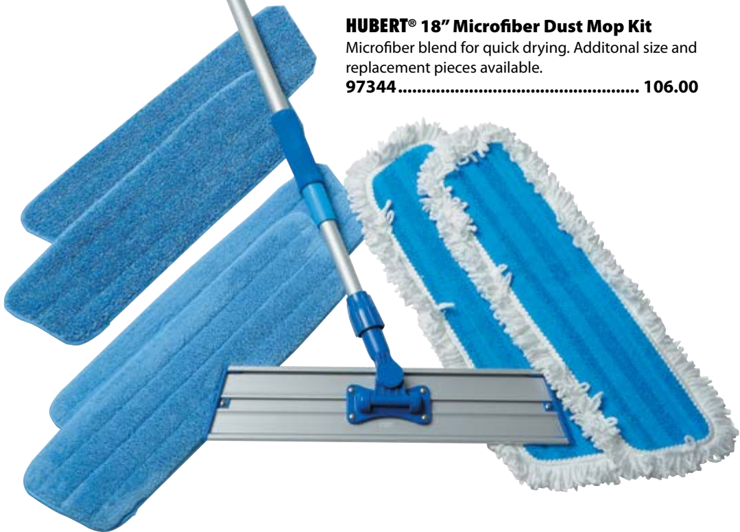
HUBERT® 18" Microfiber Dust Mop Kit Microfiber blend for quick drying. Additional size and replacement pieces available. 97344..... 106.00