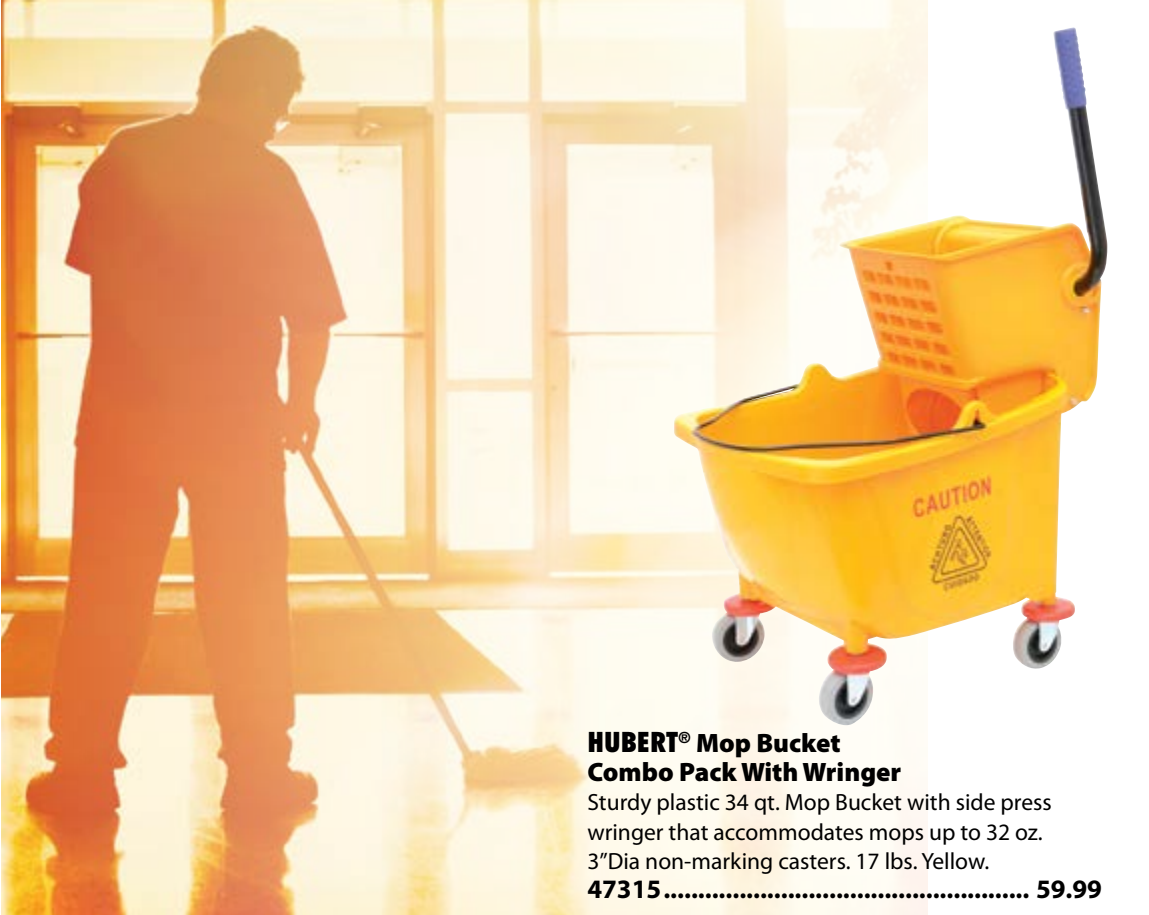
HUBERT® Mop Bucket Combo Pack With Wringer Sturdy plastic 34 qt. Mop Bucket with side press wringer that accommodates mops up to 32 oz. 3"Dia non-marking casters. 17 lbs. Yellow. 47315..... 59.99