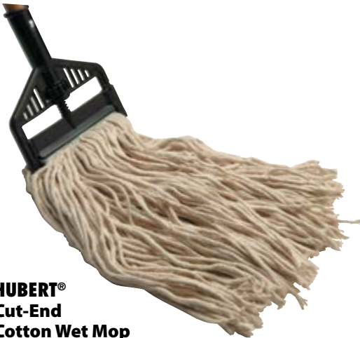
HUBERT® Cut-End Cotton Wet Mop 100% cotton yarn absorbs 2 to 3 times its own weight in moisture. Not launderable. Use with Gate-Style Mop Handle, sold separately. 24 oz. 1"W. 3 per pack. Additional sizes available. 48892.....20.09