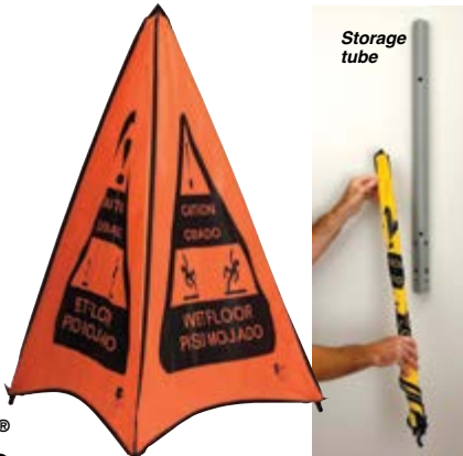
HUBERT® Safety Orange Bilingual Pop-Out Safety Cone Bilingual warning in English and Spanish. Storage tube with 3 mounting options included with each unit. 32"H. 16155..... 34.99