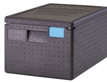
Cambro Cam GoBox® Black Plastic Top Loading Pan Carrier SKU #52995