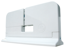
Tamper Evident White Poly Bag Sealer SKU #22489