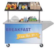
Mobile Breakfast Cart by HUBERT® SKU #76306