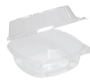
Clamshell Clear Polystyrene Hinged Carryout Container SKU #71456