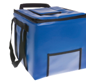
Sterno® Blue Insulated Milk Crate Bag SKU #58692