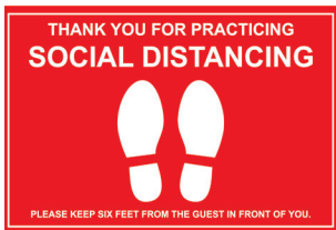
Vinyl Social Distancing Floor Marker - 12"L x 18"W