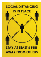
Expressly HUBERT® Yellow Plastic Social Distancing Sign For Crowd Control - 8 1/10"W x 11 3/4"H