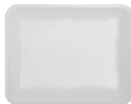
White Foam Trays

SKU #51761 • Unlimited number of post can be connect • 14"Dia x 40"H