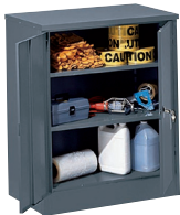
Edsal Grey Steel Industrial Counter-Height Cabinet SKU #52896 • 36”L x 24”D x 42”H