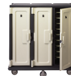
Cambro Granite Grey Polyethylene Tall Profile Meal Delivery Cart

SKU #36840 • Durably constructed for strength • Can be sealed for freshness in a wrapper - 500 case pack